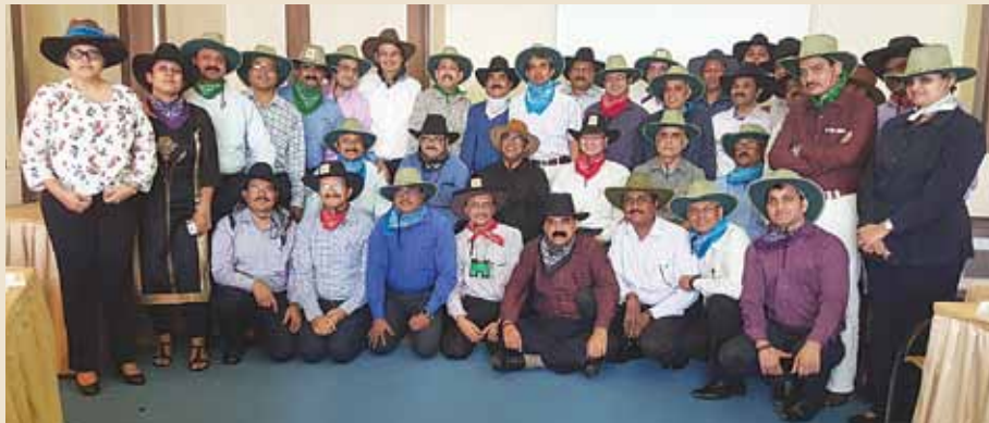
The creatively hatted Blue Cross senior management team which attended the workshop!

To build these skills, an international business simulation workshop, titled ‘Lost Dutchman’s Gold Mine’ was organised in Mumbai for the Blue