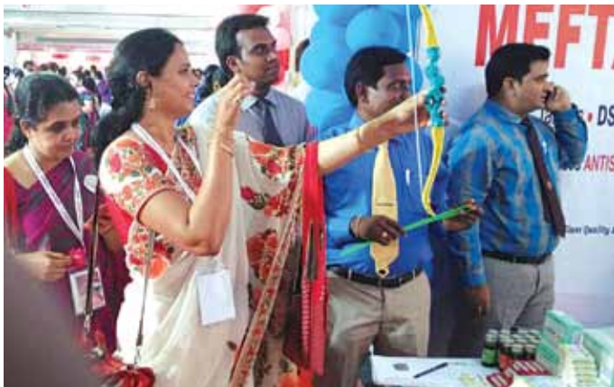
There was keen participation in the fun game that was played at the Blue Cross stall.

The first Telangana Congress of Obstetrics and Gynaecology (TCOG) was recently held in Karimnagar in Telangana State. Blue Cross put up an attractive stall, at which a range of the company's products was displayed and a fun game was played.