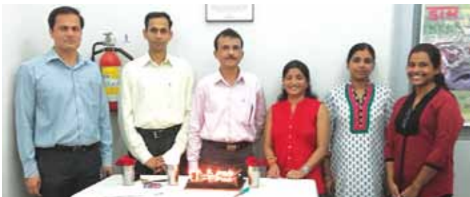
In Goa, team members who celebrated their birthdays in December 2015 are ready to cut a birthday cake!