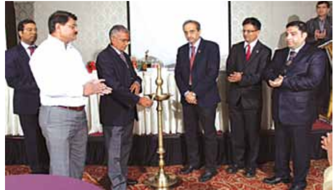
The inaugural lamp is lit at IDMA's GST Seminar in Nashik.