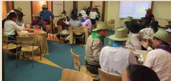
Blue Cross team members in action at the workshop.

Cross senior management team on December 12, 2015.