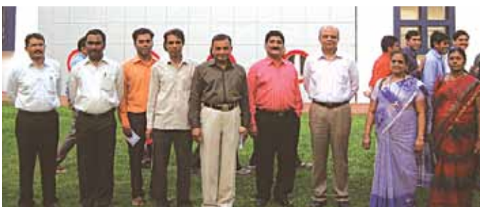
In Nashik, the enjoyable November monthly celebration was held on November 30.