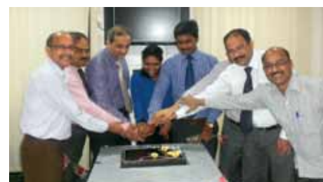
The Human Resources Department organizes fun-filled monthly Birthday Celebration for the team. Members of the Mumbai team are seen at the April and June 2014 celebrations.