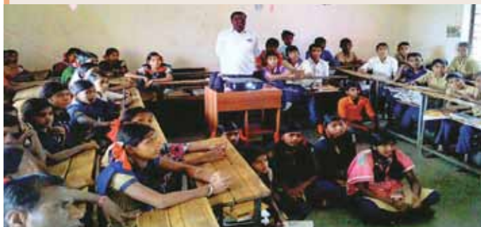
Teachers and students at one of the schools in which Blue Cross has sponsored and conducted the E-Learning programme.

Blue Cross has entered into an agreement with Wockhardt Foundation to sponsor and conduct an E-Learning programme for students from standards I-X in 18 rural schools in Nashik District. This programme makes learning a fun-filled, interactive experience and has been developed by E-Learning experts. It follows the State Board curriculum and aims at ensuring excellence through high quality and innovative teaching methods.