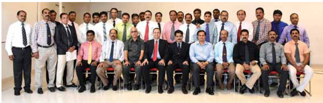
All the winners seen with senior Blue Cross managers.