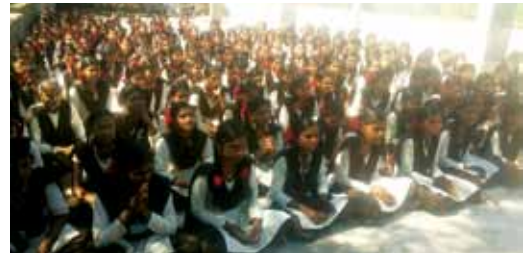
right: At Kopergaon, Nashik Zone