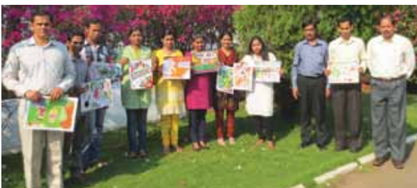
In Goa, Holi was celebrated on March 5, 2015, with the organisation of a painting competition.