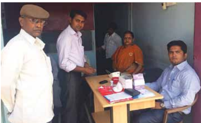
A DDC was conducted at Ichalkaranji, Pune Zone