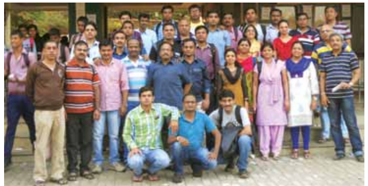
The Nasik team went for a fun-filled picnic to Shangri-La Resort & Water Park.