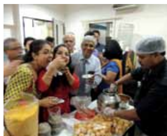
Keen participation in Holi celebrations in Mumbai.