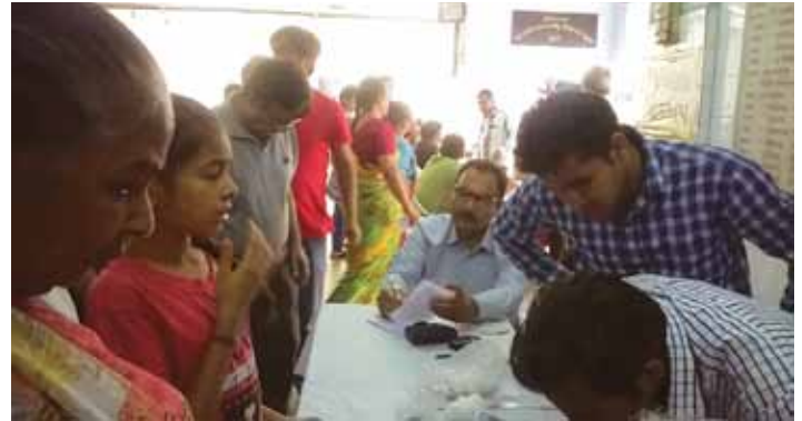
A DDC was conducted at Maninagar in Ahmedabad.

A number of Disease Detection Camps (DDCs) were conducted during the past two months, during which the focus was on detecting Diabetes and Hypertension.