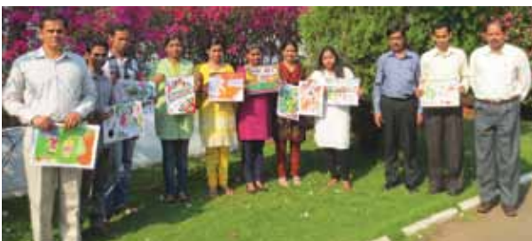
In Goa, Holi was celebrated on March 5, 2015, with the organisation of a painting competition.