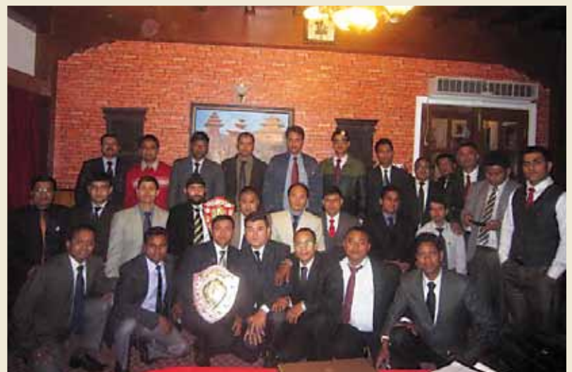
The RMs, SEs, TMs and ABMs with the Top Region and Top Zone Trophies.

Many important decisions were made after in-depth deliberations and the Zonal Managers were upbeat and highly enthusiastic about a superlative performance from their disciplined and enthusiastic teams during 2015-2016.