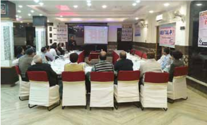
A MEFTAL Scientific Group Meeting was recently held in Meerut.