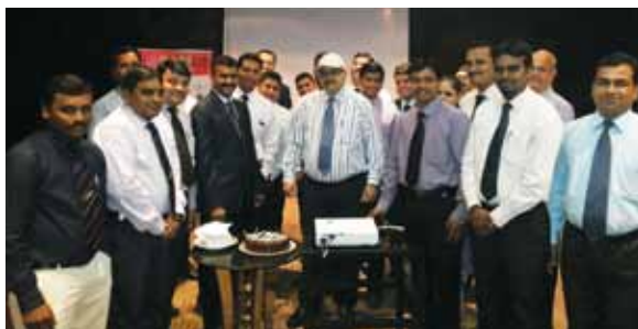
◀ Jubilant EXL team members celebrate the new sales record by cutting a cake.