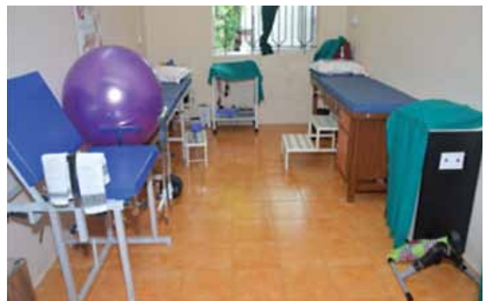
The new Physiotherapy Center is equipped with up-to-date facilities.