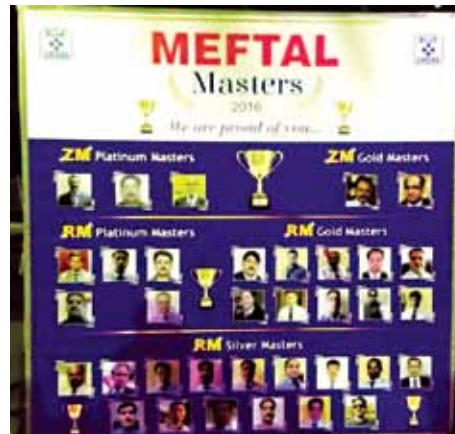
A standee with pictures of all Managers who were winners in different categories of the MEFTAL Master's Contest 2016.