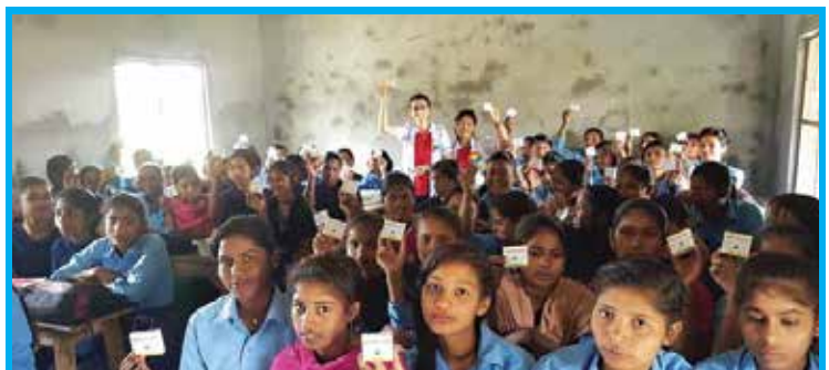
A free Health Camp was organised by the Blue Cross team in Birganj, Nepal. It was held in Samanpur near Garuda. Two doctors from the National Medical College participated in the camp