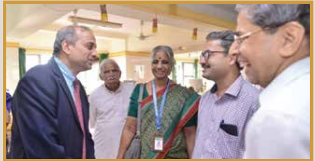
This generous donation was warmly appreciated by representatives of the Nana Palkar Smruti Samiti, who said that the machines would be very useful in offering very economical / free services to the needy patients undergoing dialysis treatment.