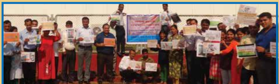
Goa Plant employees came together with CDSCO, Sub Zone Goa, to spread awareness on cleanliness on the occasion of Swachhata Pakhwada on April 9 th . CDSCO team members and the Goa Plant team took the 'Cleanliness Pledge'