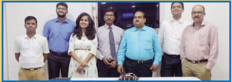
Monthly functions were organized for the months of April, May and June to celebrate employees birthdays and present awards to long-serving employees