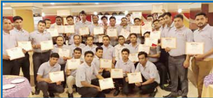
The Bhopal Team