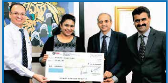
The Blue Cross donation cheque is presented to a representative of SOS Children’s Villages

Through the 3S (Special Social Support) Donation Programme, which is linked to the sales of TUSQ-Dx Liq., TUSQ-x+Liq. and TUSQ-LS Liq., Blue Cross tries to lend a helping hand to needy sections of the Society. Part proceeds from the sales of these products are donated to nationally recognised NGOs. Blue Cross regularly appeals to doctors to support this social effort by prescribing TUSQ medicines to appropriate patients, as the Company donates ₹ 1 per bottle sold of these products. The positive response from doctors across India has enabled Blue Cross to make a generous TUSQ 3S donation of ₹ 11,54,000/- to HelpAge India and a donation of ₹ 5,00,000/- to SOS Children’s Villages.