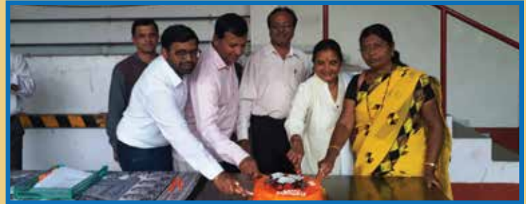
Monthly functions were organized for the months of April, May and June to celebrate employees birthdays and present awards to long-serving employees