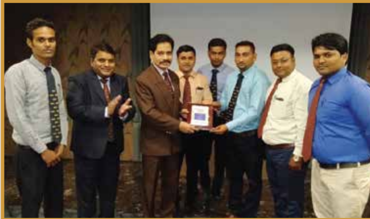
The Kanpur Region Team, Lucknow Zone