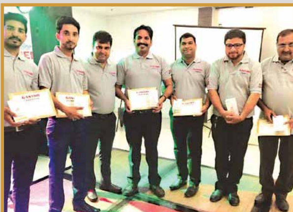
The Rohtak Region Team