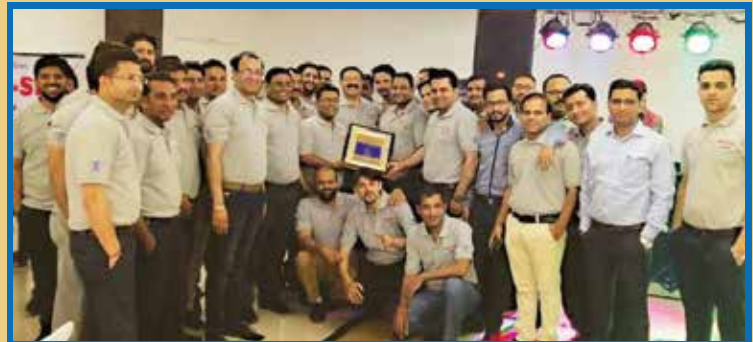
The Faridabad Team