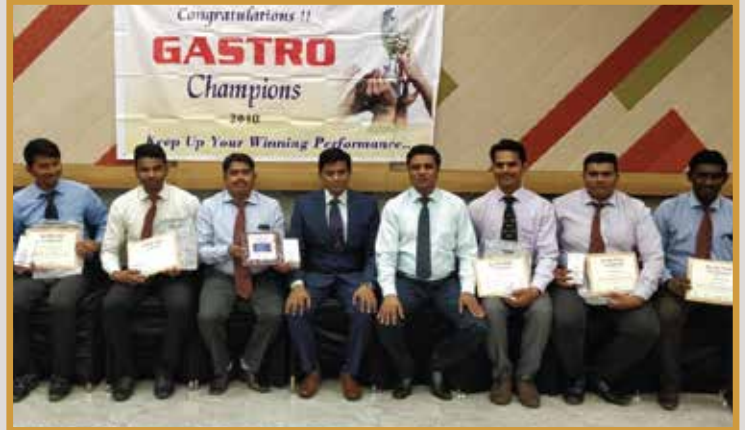
The Hyderabad Team