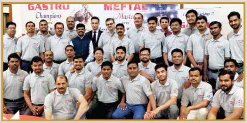
The Gastro Champions & Meftal Masters from BC Pune, EXL Pune and EXL Kolhapur Zones.