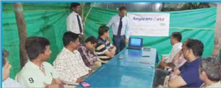
A Scientific Group Meet (SGM) was recently held in Hingoli, Nagpur Zone