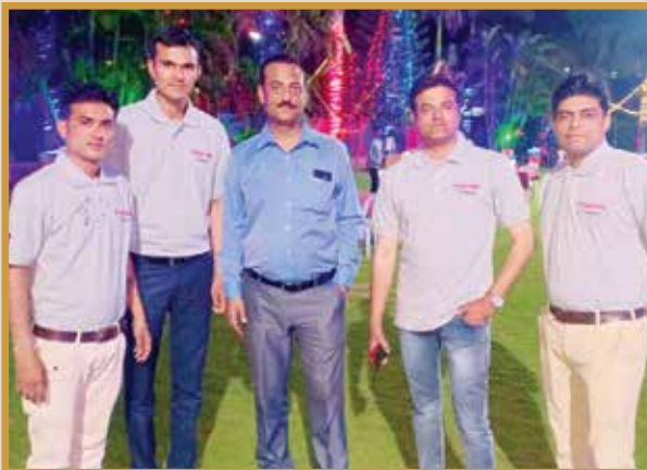
The Ujjain Team