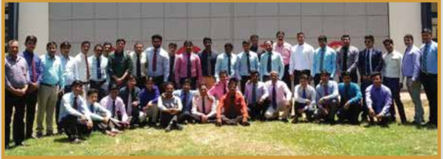
Group of SE's visited Nashik Plant on May 12 th and June 9 th . They were taken on a round of Production, QC/QA and R&D Departments. They attended the presentations titled "Pharmaceutical Quality Management System" and "R&D Bridging the Gap" at Hotel Grand Rio and lunch thereafter