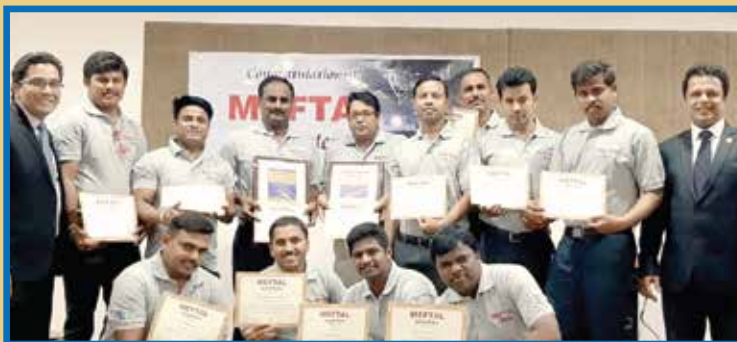
The Bangalore Team