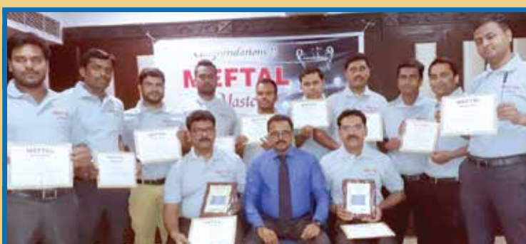
The Hyderabad Team