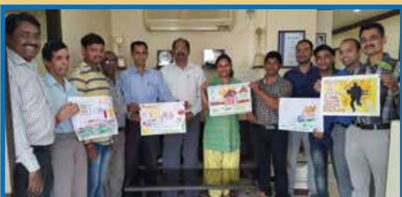
We witnessed our employees creativity & enthusiasm during the Safety Poster competition organised on the occasion of National Fire Service Week from April 14 th -20 th