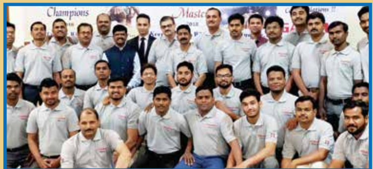
The Pune Team