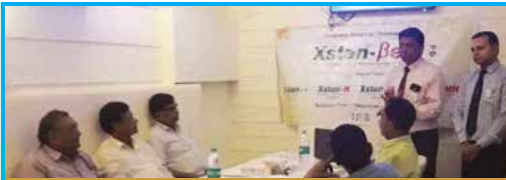
An extremely informative RTSM on Management of Hypertension was conducted at Yavatmal, Maharashtra on April 24 th