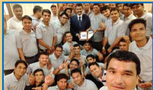
The Jaipur Team