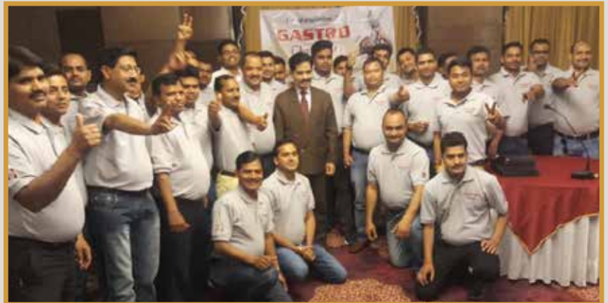
The Patna & Ranchi Teams