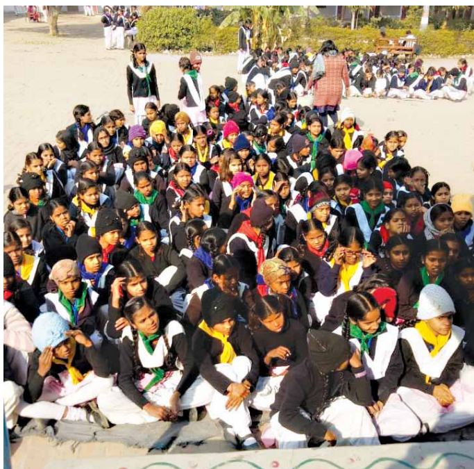
The Camp at Adarsh Kanya High School, Modinagar, witnessed keen enthusiasm from 200 girls.