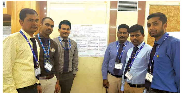
BC February Batch Winners

"To be a winner, you must plan to win, prepare to win and expect to win"