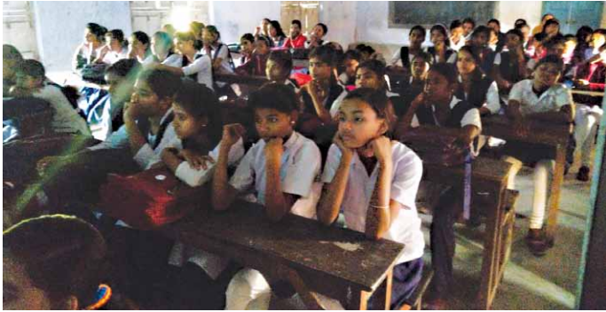
The Camp at Panchghara Pramoda Sundari High School, Hooghly, benefitted over 100 girls.

A series of School Dysmenorrhea Camps was conducted across India to benefit a large number of girls, who learned that periods need not be painful.