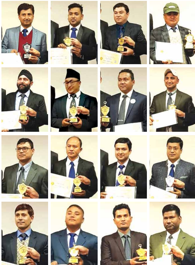
Some of the winners with their awards.