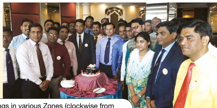
Glimpses of CILNIBLU launch meetings in various Zones (clockwise from top left) Kolhapur, Nagpur, Hubli & Bangalore and Karimnagar.