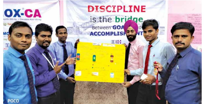
BC January Batch Winners

In-depth training programmes were held in Mumbai for both Excel Division and BC Division team members. During the poster presentation session, both teams created eye-catching posters.