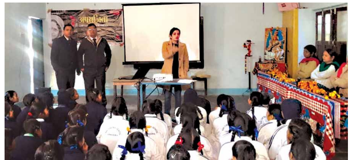
A view of the camp that was conducted at Nav Chetana High School, Rishikesh, for around 130 girls.

Around 350 girls were present at the camp that was conducted at Jijamata Girls High School, Lasalgaon, Nashik.