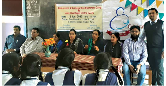
Over 150 girls benefitted from the camp conducted at Ram Manohar Lohia School, Raipur.