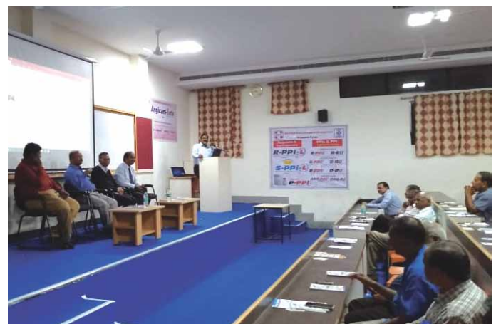
A CME was held at PES Medical College in Kuppam (Andhra Pradesh). It focussed on Diabetes Mellitus and was attended by 103 doctors.