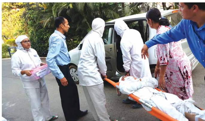
T o gain expertise in handling emergencies, a Mock Drill was conducted on December 22. Activities carried out during this drill included extinguishing a fire, rendering First Aid, shifting patients to a hospital, a complete evacuation, conducting a headcount and communication during emergencies.