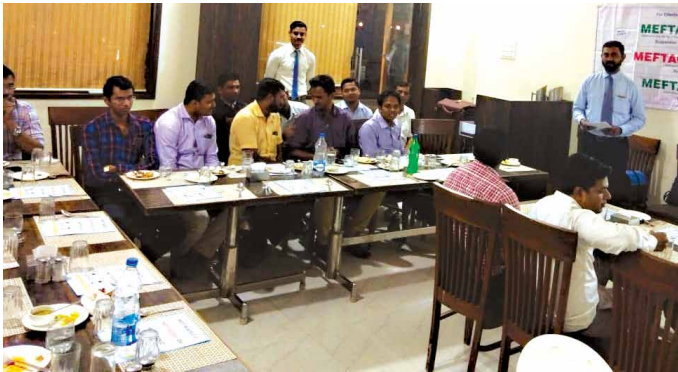
A RTSM on the Meftagesic range was held in Panvel, Navi Mumbai, on February 15. This conference was attended by 20 General Physicians. The therapeutic action and scientific benefits of MEFTAGESIC were explained.