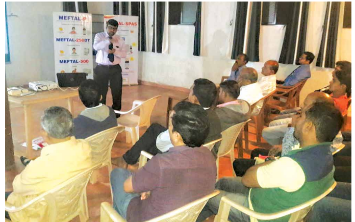
A Scientific Group Meet was recently held in Malkapur, Kolhapur. The MEFTAL Range was discussed during the meet.