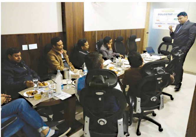
A RTSM focussing on the DOLOSTAT Range was conducted in Varanasi for a group of Dentists, on February 19. The topic discussed was Management of Dental Pain and Inflammation.