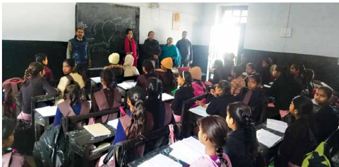
The Camp at Dayawati Modi Kanya High School, Modinagar was attended by approximately 100 girls.