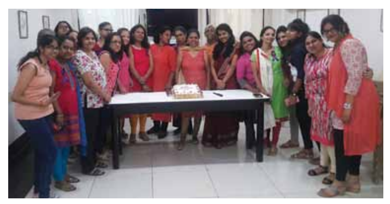
At Head Office, Mumbai, women employees gathered together to celebrate and have a good time.