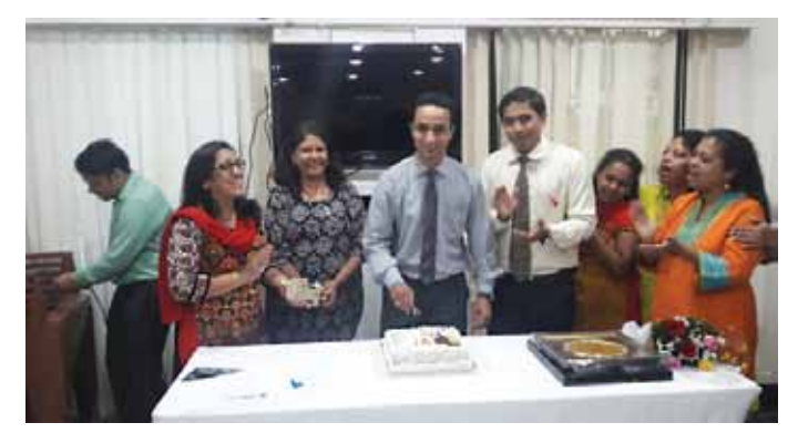
Cake-cutting ceremony during the monthly function in