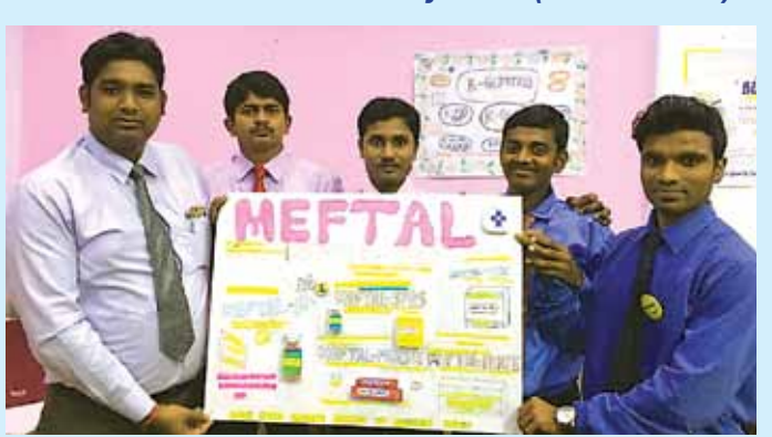
Batch 1 winners - February 2017 (XL Division)