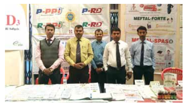
The BC and EXL Division team members put up an attractive stall displaying a range of products at the 16th Annual Conference of the Ranchi Obstetrics & Gynaecological Society.