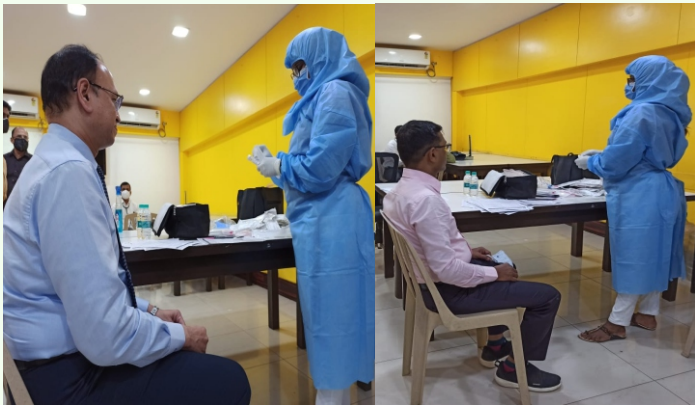
HR & Admin Departments Organised successful RT-PCR test in coordination with SRL Diagnostic for the Safety of the entire Office Staff