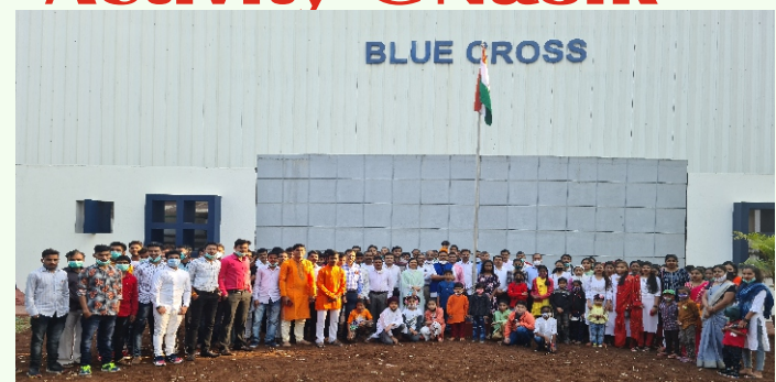
72nd Republic Day was celebrated on January 26th, with the hoisting of the National Tri-Colour at the factory. Employees were present on the occasion with their families.