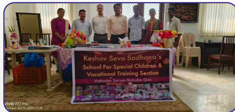
The BCL Goa plant curated a special exhibition that featured hand-made Diwali lanterns and diyas crafted by the 'specially-abled children' of Keshav Seva Sadhana School, Bicholim. The exhibition, organized as part of our Corporate Social Responsibility (CSR) efforts, showcased exclusive and colorful items created by these talented children.