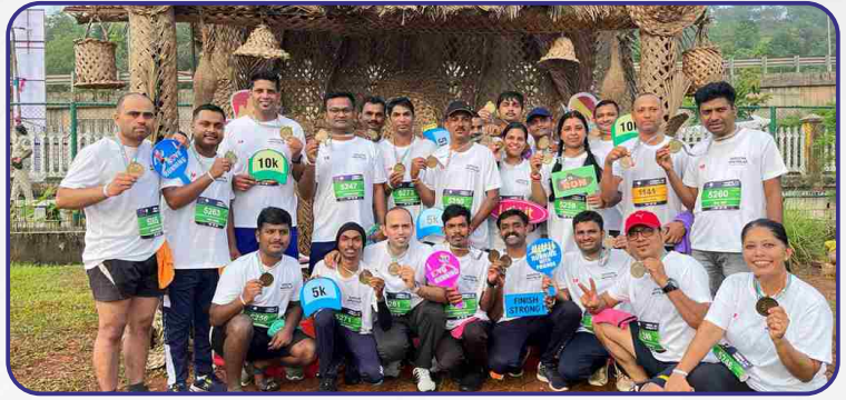
The Dr. Ramani Marathon was held in Ponda, Goa, where thirty employees from different departments of the Goa plant showcased their sporting spirit by participating in the Marathon. The employees enthusiastically took part in both the 10 Km and 5 Km runs. Notably, the event received support from Blue Cross through its Corporate Social Responsibility (CSR) initiative, underlining the company's commitment to community engagement and promoting a healthy and active lifestyle among its employees.