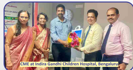
CME at Indira Gandhi Children Hospital, Bengaluru

In parallel, the CME sessions brought together healthcare professionals from various specialties to discuss the latest advancements, best practices, and guidelines in medical care. These sessions not only facilitated knowledge exchange but also contributed to the professional development of participants. By organizing these initiatives, Blue Cross Laboratories Pvt. Ltd. reaffirms its commitment to improving public health and enhancing medical knowledge across communities. The company remains dedicated to supporting healthcare professionals and empowering individuals to lead healthier lives.