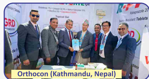
Orthocon (Kathmandu, Nepal)

Blue Cross Laboratories Pvt. Ltd. continues its commitment to promoting health and well-being through its Healthy People Awareness Program. As part of this initiative, the company has organized Health Camps and Continuing Medical Education (CME) sessions across several cities. The Health Camps provided valuable healthcare services directly to communities, offering free medical check-ups, consultations, and diagnostic tests. These camps aimed to reach out to underserved populations and raise awareness about preventive healthcare measures.