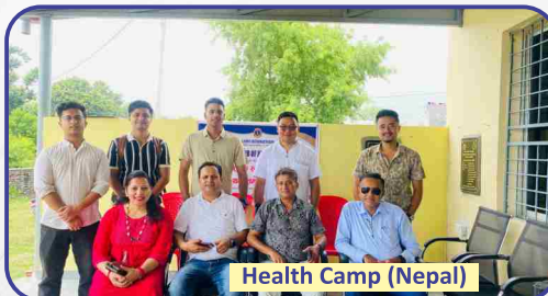
Health Camp (Nepal)