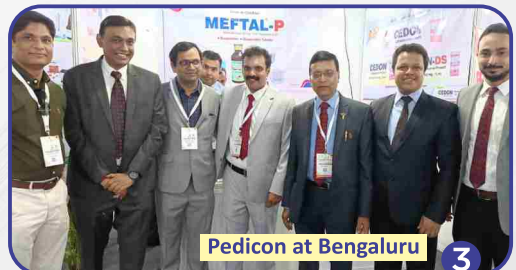
Pedicon at Bengaluru