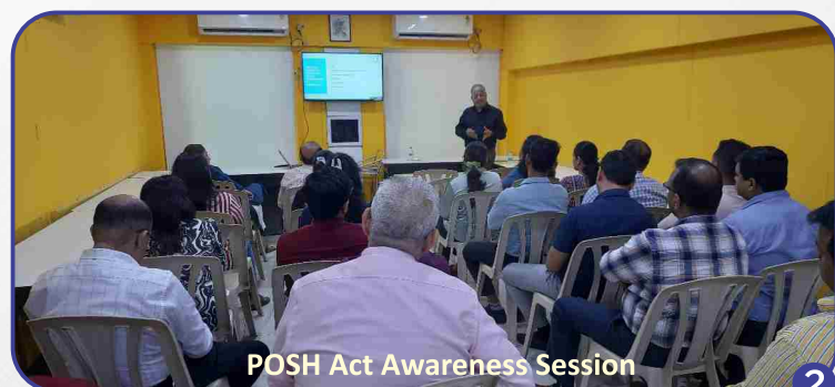
POSH Act Awareness Session

The session concluded with an engaging Q&A, where participants discussed practical challenges, policy enforcement, and the available support mechanisms. Blue Cross is committed to promoting continuous awareness and compliance with the POSH Act and plans to hold further sessions to reinforce its dedication to a safe, inclusive, and respectful workplace.