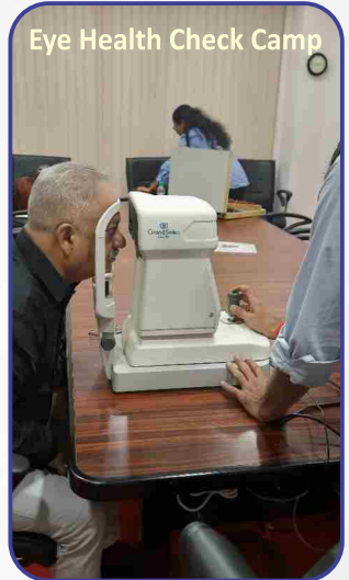
Eye Health Check Camp