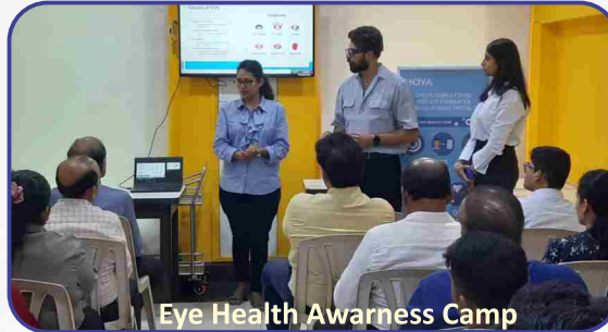
Eye Health Awareness Camp

Following the eye examinations, an engaging awareness session was held in the cafeteria, where participants learned about the importance of regular eye check-ups and effective eye care practices. The camp emphasized that maintaining good vision is vital for overall well-being.